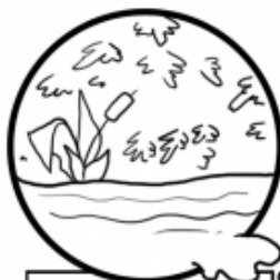
WATER TURNS TO BLOOD