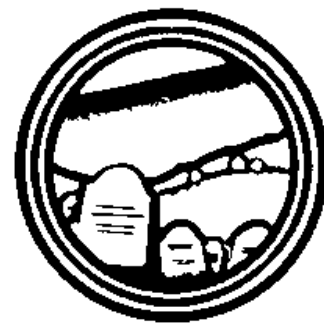
Death of First-Born Exodus 11:1-12:36