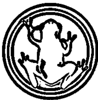
Amphibians (Frogs) Exodus 7:26-8:11