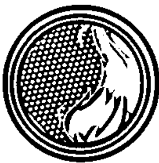
Hail and Fire Exodus 9:13-35