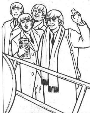
The Beatles fly to America.