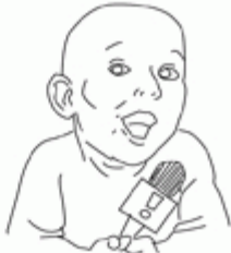
dishy celebrity news correspondent