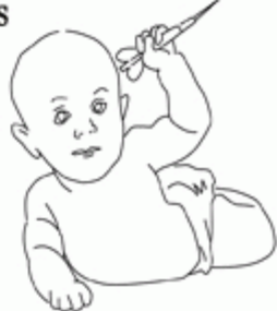
professional darts hustler