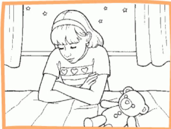
4. I can talk to Heavenly Father in prayer, and He will answer me.