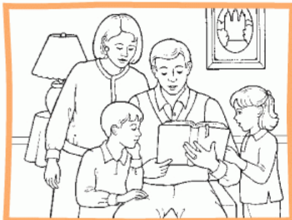
3. Heavenly Father asked special people to help me and guide me.