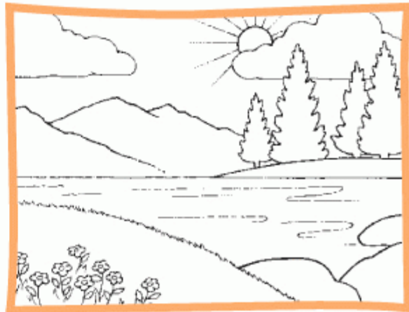
2. A beautiful world was created for me.