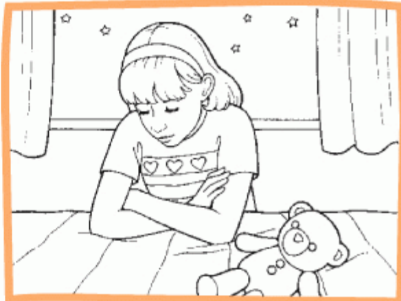
4. I can talk to Heavenly Father in prayer, and He will answer me.