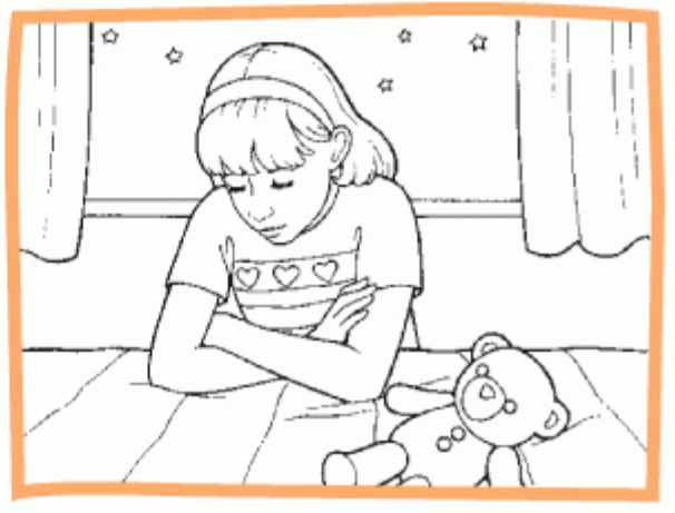
I can talk to Heavenly Father in prayer, and He will answer me.