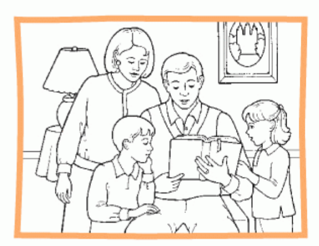
Heavenly Father asked special people to help me and guide me.