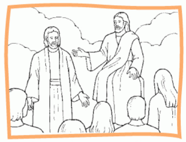
I lived in heaven with Heavenly Father and Jesus Christ before I was born.

Instructions: Read the captions under each picture. Then color the pictures. You could use these captions and pictures for a family home evening lesson or a Primary talk.