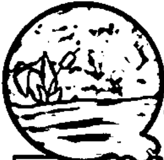
WATER TURNS TO BLOOD