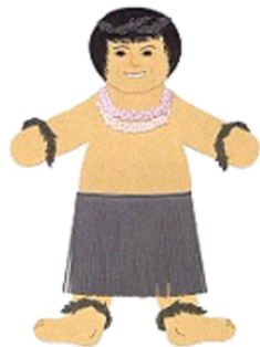
Sample Flat Stanley (from Hawaii)