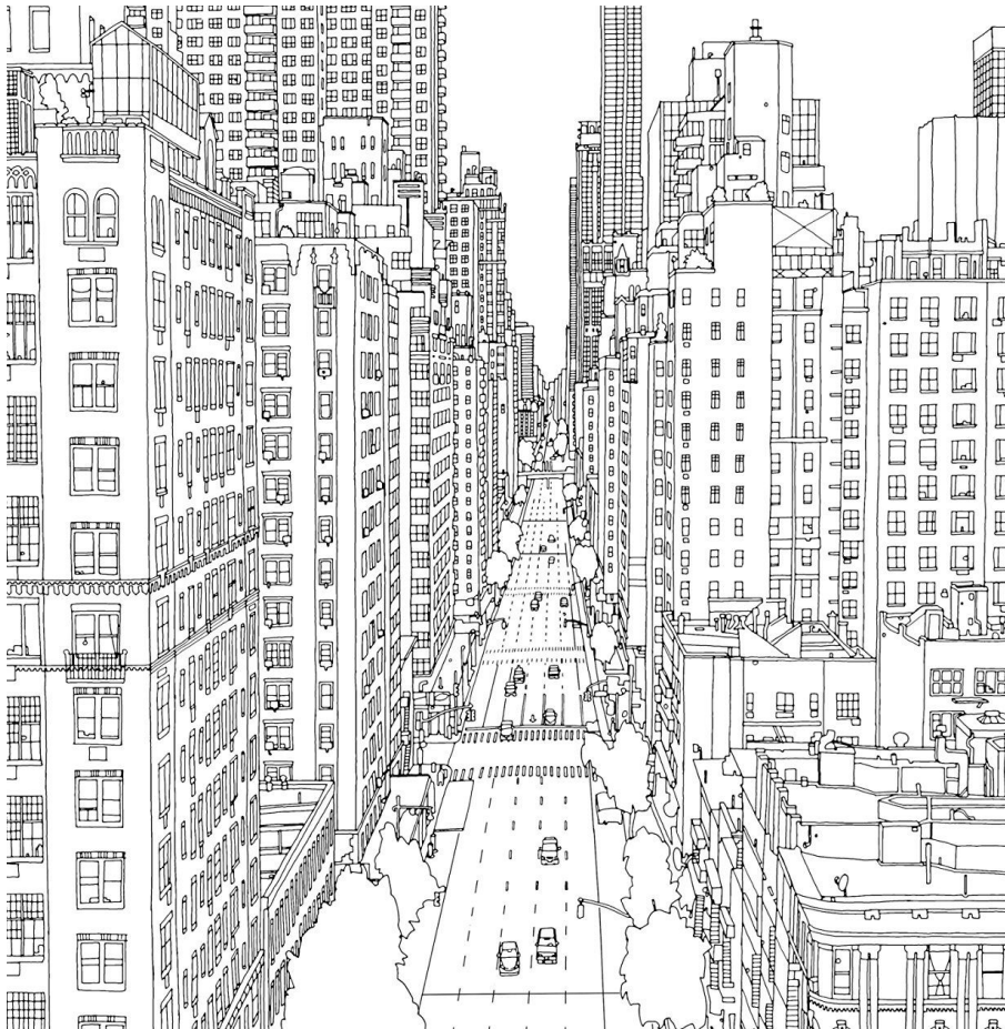
1st Avenue and East 60th Street, Manhattan, New York, United States