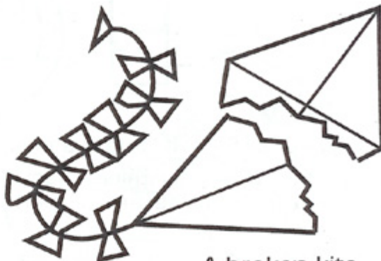
A broken kite