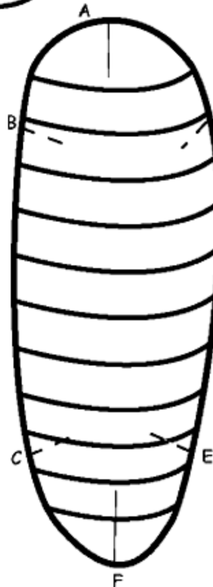
Bottom of Body