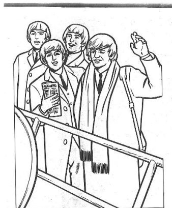
The Beatles fly to America.