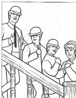
"Do you like us in our derbies?"