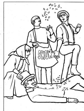
TRYING OUT A NEW ROUTINE