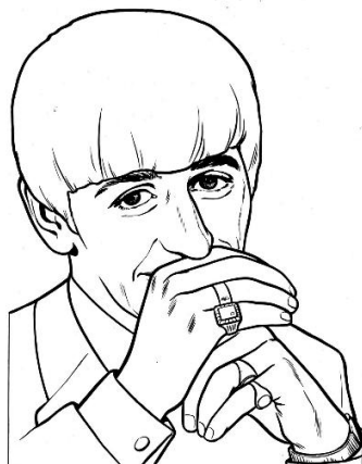
I get my name because I wear lots of rings on my fingers. I play the drum.