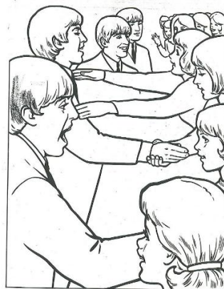
English girls welcome the Beatles.