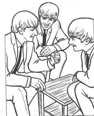
The boys find a moment for conversation.