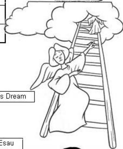
Jacob and Esau