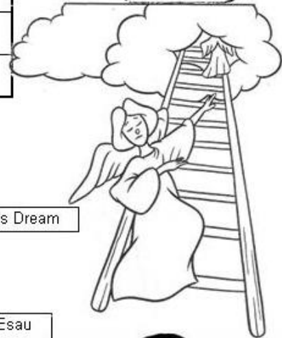
Jacob and Esau