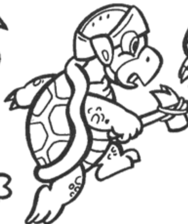
THE HAMMER BROS.